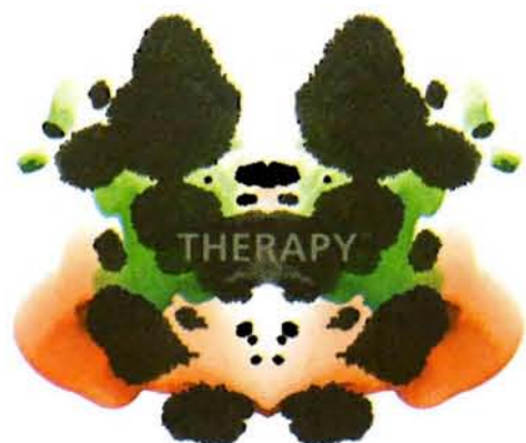
NARAMATA BENCH PINOT GRIS 2004

We put the Therapy labels association to the test here at CityFood and polled the following results. What this says about the state of our psyche may not be pretty. CHARDONNAY: a) female genitalia ; b) two women in kimonos bowing // MERITAGE: a) girl with pigtails; b) two seals in love // PINOT BLANC: a) Dungeness crab; b) Darth Vader // PINOT GRIS: a) two pigeons on a bird bath; b) demented smiley face.