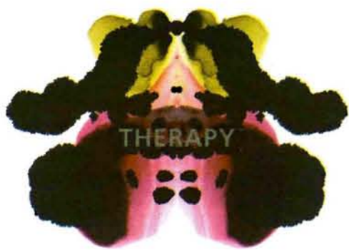
NARAMATA BENCH MERITAGE 2003