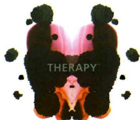
NARAMATA BENCH CHARDONNAY 2004