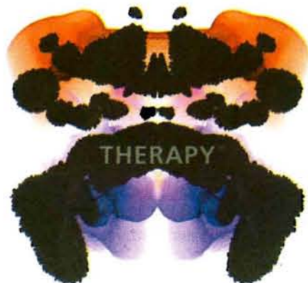
NARAMATA BENCH PINOT BLANC 2004